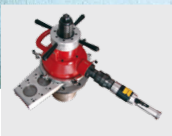
FF flange preparation up to OD 610 mm