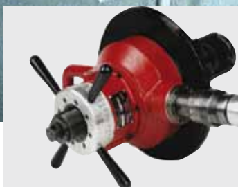
SDB-pipe end preparation form tooling up to OD 323 mm