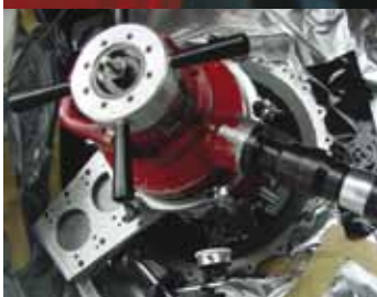
SDB pipe end preparation or FF flange preparation

Fast, easy setup – self centering design.