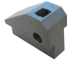
Single point beveling tool holder