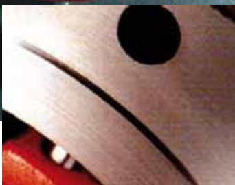
FF 3-jaw independent "short perch" mandrel or SDB mandrel principle