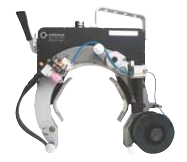
ORBIWELD TP 600 with KD 3-100 cold wire feed