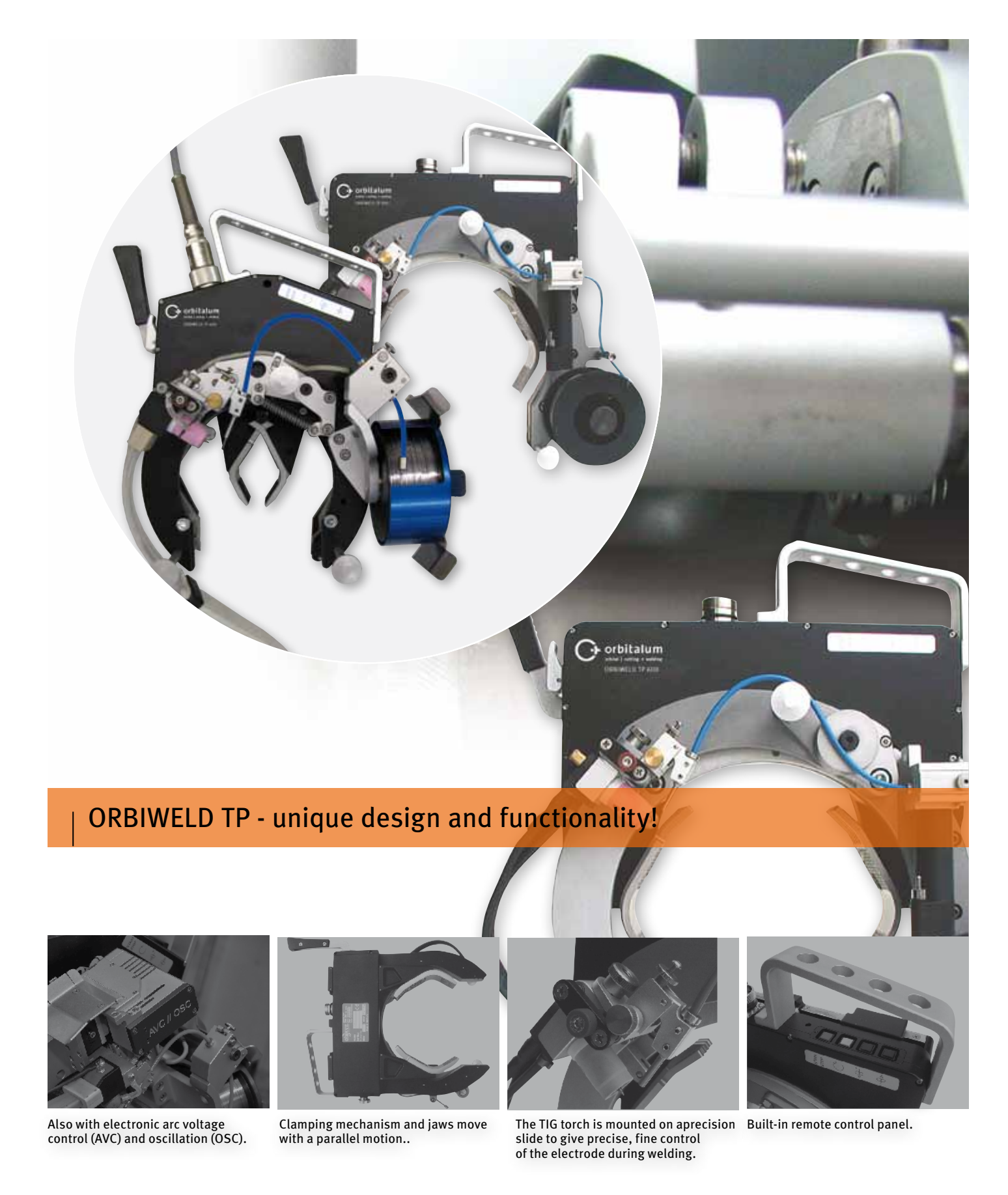
Open Orbital Weld Heads