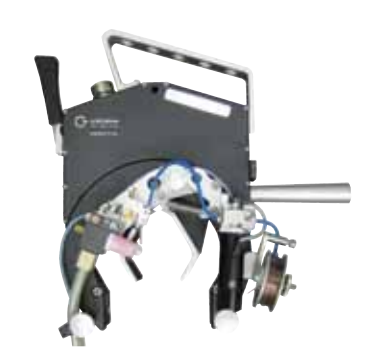
ORBIWELD TP 400 with KD 3-62 cold wire feed