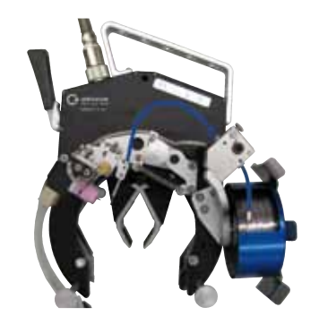
ORBIWELD TP 400 with KD 3-100 cold wire feed