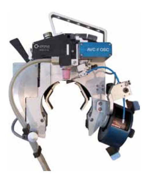
ORBIWELD TP 400 AVC/OSC