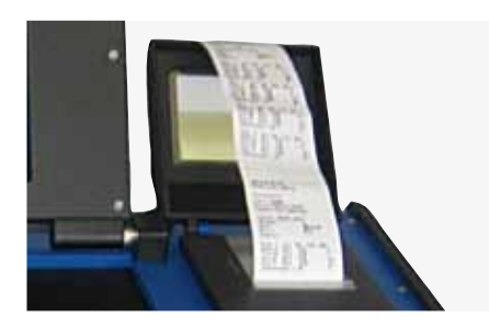
Integrated job printer allows actual values to be printed out