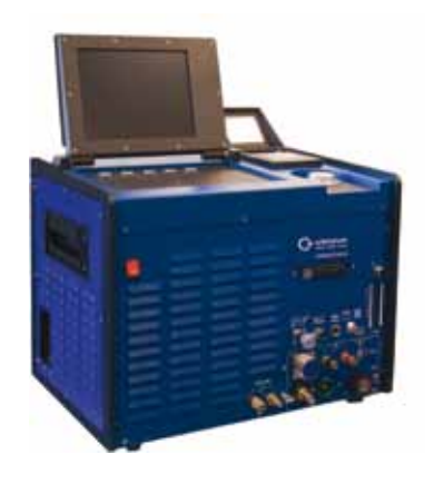
ORBIMAT 300 CA