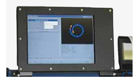
Clearly laid-out 10.5" swivel monitor