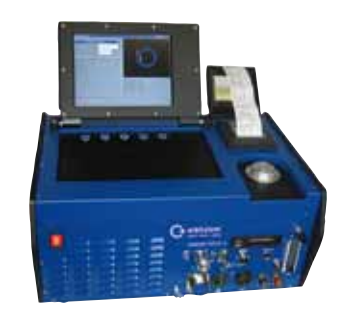
ORBIMAT 165 CA