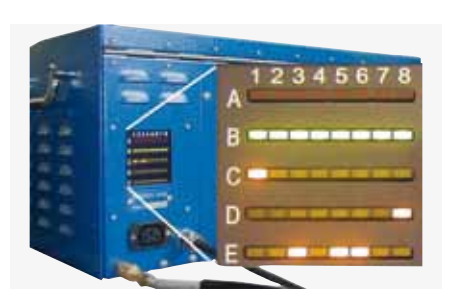
PSS Pro-Service System: Simple functional test with no need to open the unit