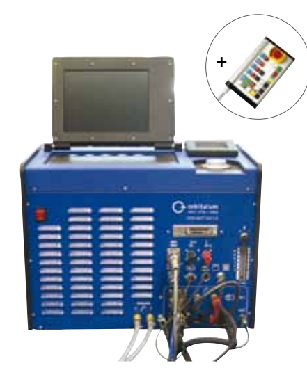
ORBIMAT 300 CA AVC/OSC incl. remote control