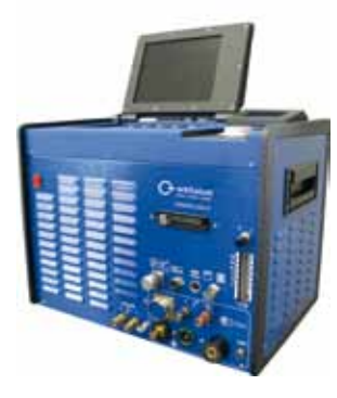
ORBIMAT 300 CA AC/DC