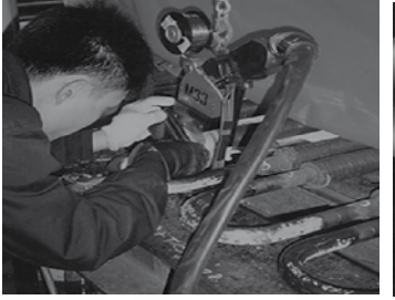
The OP 51 and 102 are also available with electronic arc voltage control (AVC) and oscillation (OSC).