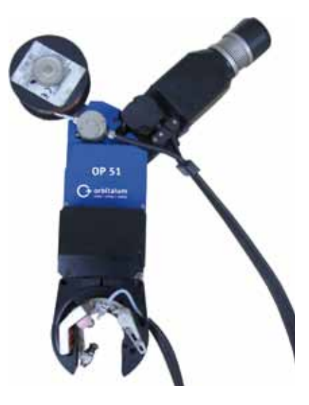
Open weld head OP 51-1