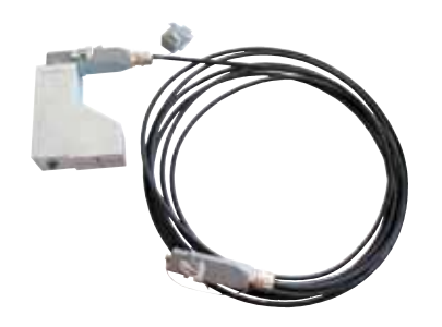
Feeding unit including cable