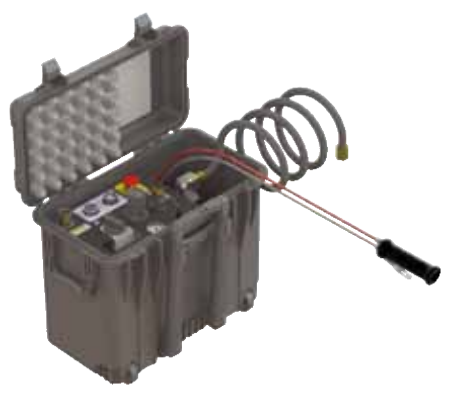
Air treatment module and remote control in a rugged light portable package.