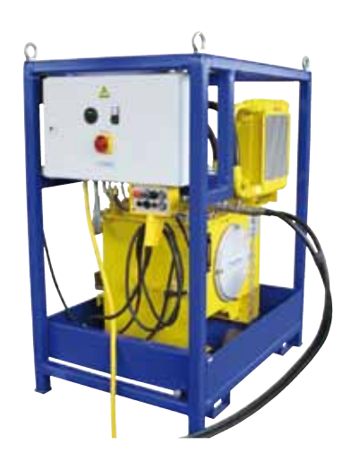
Hydraulic Power Pack - Rear View