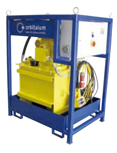
Hydraulic Power Pack