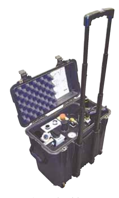
Air Control Module ACM for pneumatic motors