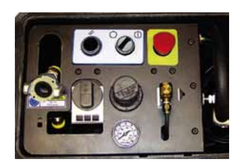
Ergonomic fingertip control for all air functions with safety stop button.