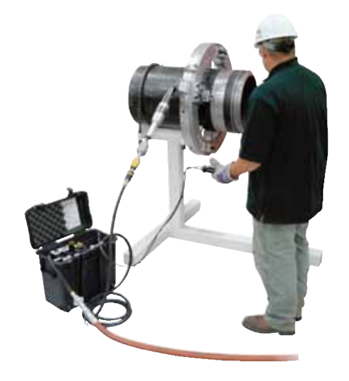
ACM controlling Low Clearance Split Frame